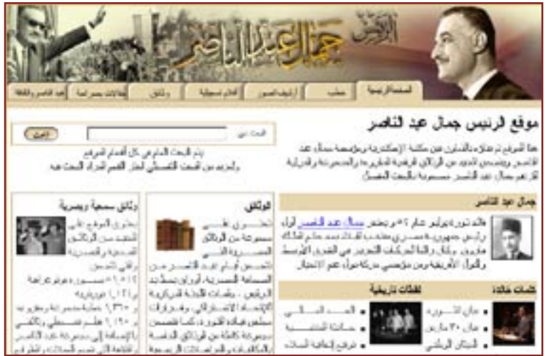
Home page of Gamal Abdel Nasser website