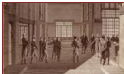
Institut d'Egypte built by Napoleon over 200 years ago

BA is taking the initiative in reviving the organization of Institut d'Egypte built in Cairo by Napoleon Bonaparte over 200 years ago. The Institut first scholars were in charge of the research, study and publication of physical, industrial and historical facts about Egypt, publishing findings that stemmed from their activities as members of that body. They were later to produce the Description de l'Egypte . Eventually, the Institut d'Egypte became the focal point for scholarly