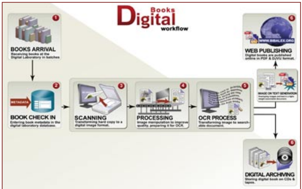
Digital Lab workflow

A database for the books, metadata and status has been designed and implemented and standards have been set for the process of digitization in order to improve quality in the scanning, processing and OCR phases. The complete