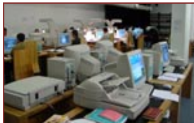
Inside the Digital Lab

cycle of the workflow for producing digital books has been automated and integrated with the Library Information System. The database was further expanded to accommodate scanned images and slides. In addition, research was carried out in co-operation with Arabic OCR producers in order to achieve efficient, high quality recognition for mass OCR production.