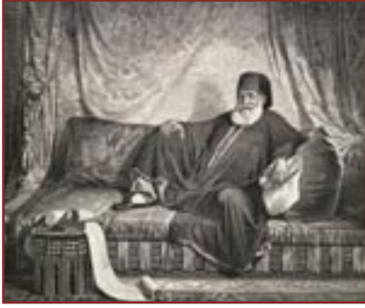
Drawing of Muhammad Ali lounging at his royal abode, "Description de l'Egypte"

This valuable collection containing images related to antiquities, natural history, and the modern states of Egypt has been fully digitized and integrated on a virtual browser with the objective of preserving it and making it publicly accessible. The collection includes eleven volumes of plates owned by BA, as well as ten volumes of text, a contribution from Institut d'Egypte . A tool was developed to publish books in the standard extended markup language (XML) format where books may be browsed by a virtual browser or touch screen. The project is composed of three stages. In the first stage, the application is provided on DVDs in two versions for the public and for researchers. During the second stage, the relation between the text and images were established and rendered in a searchable form. In the final stage, the whole collection is to be available in an integrated searchable form on the web.