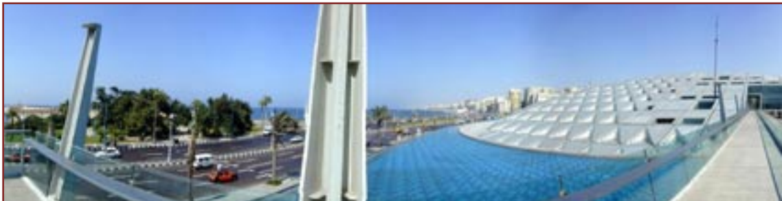
A panoramic view of the Library taken from the pedestrian bridge

Another project is also taking place aiming at developing BA as a memento to the old Library of Alexandria, while utilizing contemporary Hi-Tech methods and capabilities to make it a World Resource Center. The project, funded by the Canadian International Development Agency (CIDA), will establish a Virtual Museum - The Museion - to present the Library as a heritage of humanity throughout its evolution. Interactive educational and promotional packages for students and visitors will be developed as well. Initially, a prototype will be implemented to include a Virtual Exhibition of the History of Science and a section for Children's Library .