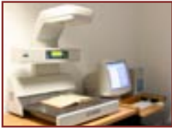
Minolta PS7000 scanner for scanning face-up originals

Initiated by Carnegie Mellon University, the primary long-term objective is to transfer all books into digital format, in partnerships with other scanning centers internationally, in order to create a Universal Digital Library, which will foster creativity and free access to all knowledge. BA and its partners (including China, India and USA) have been working to demonstrate the project's feasibility by digitizing one million books within three years and publishing them as a searchable collection on the Internet. All project partners will contribute content to ensure that the collection is extensive, diverse and multilingual. BA is expected to take the lead in scanning and digitizing 75,000 Arabic books in a three-year time frame. The target is to scan and process 5000 pages/day/scanner (2 shifts), which will lead to approximately 25,000 books/year. Moreover, the project will provide a test-bed that will support research on improved scanning techniques, optical character recognition (OCR), and indexing.