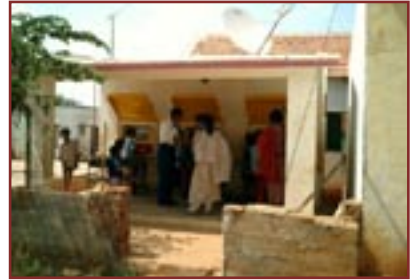
HIWEL free Internet street kiosks

The idea was initiated in India by Hole In the Wall Education Limited (HIWEL), where free Internet street kiosks were provided to children in rural areas who were unfamiliar with computers and the Internet. It was observed that, even in the absence of any direct input, mere curiosity led groups of children to explore, which resulted in learning. This led to the belief that any learning environment that provides an adequate level of curiosity and motivation can promote learning in groups of children, with no intervention from adults. It was further proven that it is possible to install a computer, connect it to the Internet, and keep it in working condition in any outdoor environment despite heat or dust, etc.