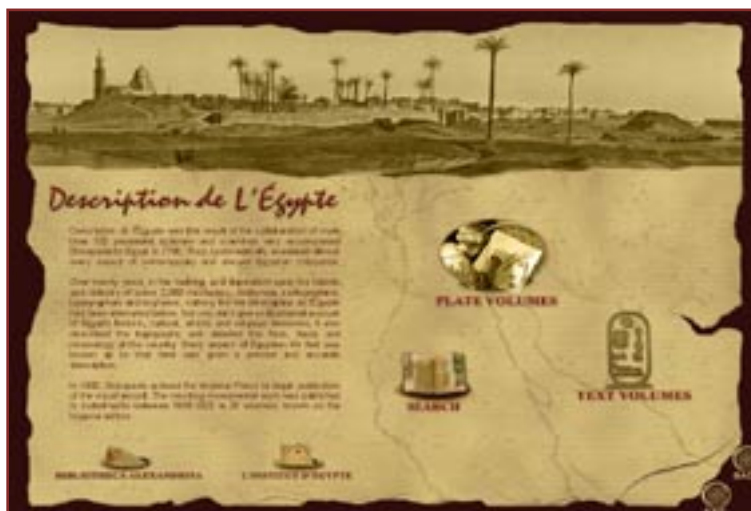
Description de l'Egypte, virtual browser main interface

Description de l'Egypte was the outcome of the collaboration of more than 150 prominent scholars and scientists who accompanied Napoleon in 1798, and some 2000 talented artists and technicians. For over 20 years, they systematically examined almost every aspect of contemporary and ancient Egyptian civilization, producing 20 volumes of text and plates of unmatched accuracy and detail. Historically these engravings became the most comprehensive record and inventory of Egypt's land and monuments.