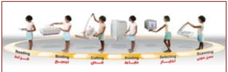
My Book: Digital & Printed process cycle

This project is designed to enable children to relate to both printed and digital information in a seamless fashion, and to bring the marvels of the digital age to the poorest parts of the community. The project teaches children that written words can be transformed from digital format to printed format and then to a bound book and vice-versa.