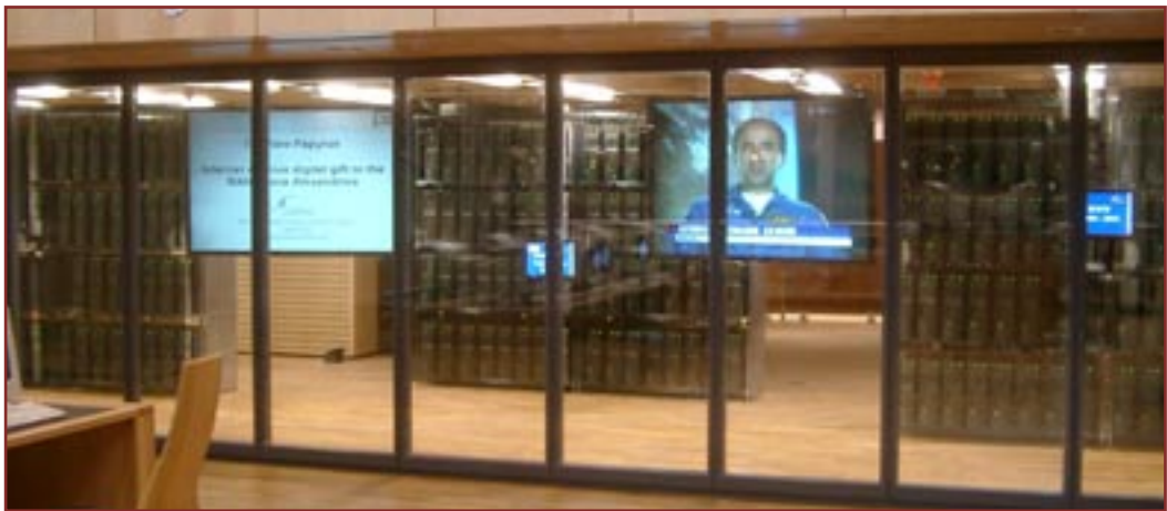
The Internet Archive displaying an archived TV broadcast