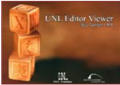
The UNL Editor application splash screen

In December 2003, BA hosted the International Conference on Convergence of Knowledge, Culture, Language and Information Technologies in cooperation with UNDL, the Royal Scientific Society of Jordan, the United Nations and UNESCO. In July 2004, partnership with UNDL was established and an agreement was signed in favor of BA to host the Ibrahim Shihata Arabic-UNL Center (ISAUC).