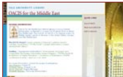
The OACIS project official website

Initiated by Yale University Library, OACIS proposes the creation of a publicly and freely available electronic union list of serials and journals from or about the Middle East. The mission of OACIS is to improve access to Middle Eastern serials in libraries in the United States, Europe, and the Middle East and to make scholarly literature from, and about, the Middle East widely and easily available to scholars around the world.