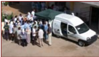
Bookmobile unit at one of the schools

They are attracted to the project booths where they are allowed to print and bind books, and retain them too. A portal has been implemented with over 250 digitized Arabic children books and a database has been designed and implemented to hold their meta data. (visit http://archive.bibalex.org/mybook )