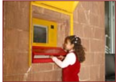
A prototype of one kiosk has already been set inside BA

A portal holding some interesting sites for children, with games, stories and educational tools has been built. A prototype of one kiosk has already been set inside BA and another in the BA plaza. In cooperation with the Governorate of Alexandria, 30 other locations are being selected to establish the kiosks. A committee comprising the best social researchers in Egypt are designing the experiments to be conducted and analyzed.